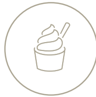
Ice Cream Van Visits