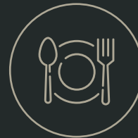
Spacious Dining Room

Our dining room serves as a gathering place for our residents to enjoy delicious home-cooked meals together. The comfortable bedrooms are thoughtfully designed, allowing personalization with small furniture, photographs, and belongings. In our inviting lounge, residents can unwind while catching up on their favourite TV shows or enjoying a collection of paperback and audio books. For moments of relaxation, our garden provides a tranquil escape, and our salon offers additional opportunities for pampering and relaxation.